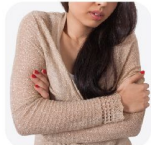
Fear Of Cold