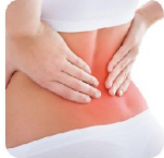
Low Back Pain